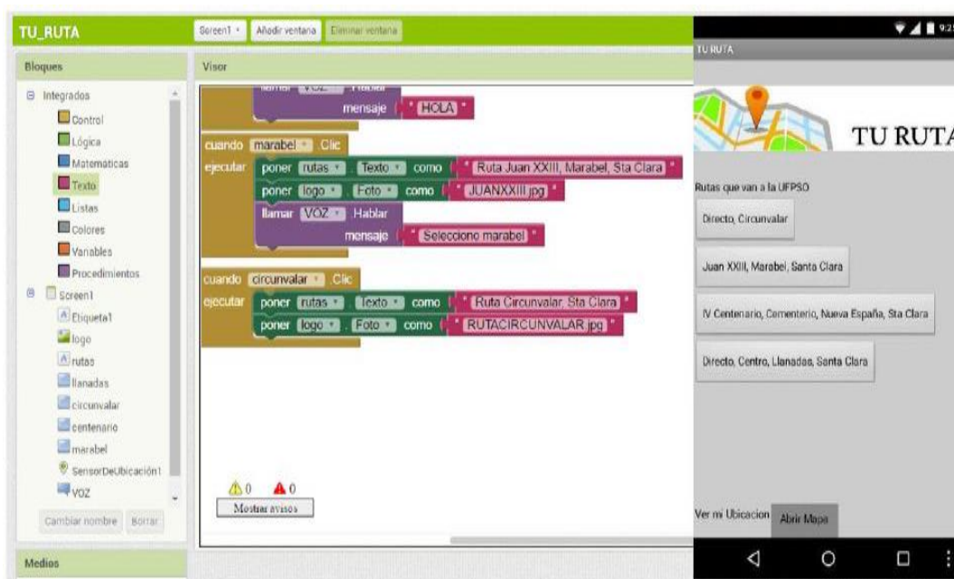
Figure 5. View of the main menu in the mobile application.

In Version 2.0 it is planned to add to the application the free seat counter, so that passengers can preview this information in real-time, along with the distance between the user and the position of the bus, highlighting this as a plus in terms of time management that users take to review the mobile application and choose the route that best suits their needs, it should be clarified that for the use of the application is necessary to grant location permissions [31]. Because an API of google maps is used to visualize the useful routes and also at the time of estimating the distance between the bus and the user since it will be taken as a reference to the location provided by the GPS of the microbus with the one provided by the GPS present in the user's mobile device.