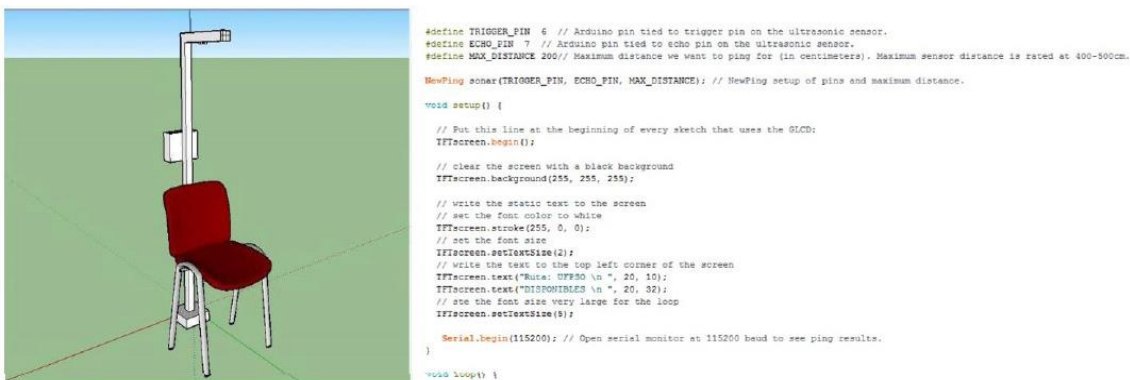
Figure 4. 3D simulation and programming of the sensor distance on the full-scale prototype.

For programming starts from the ultrasonic sensor, which is encoded to be activated at a certain distance, in this case at twenty (20 cm) from its original location, when sending a signal, the code is running through two cycles, which evaluate which condition is met, and depending on this, a message is sent by screen of the availability of positions "1" or "0" The GPS is responsible for sending several variables, but in this particular case, only need, longitude and latitude, and to read the data that the GPS receives was necessary to import a library called TinyGps; to be able to use it is necessary to import it, copying it in the libraries folder, where the Arduino IDE is installed, and then restart the program so that it loads correctly; the library will correctly identify the longitude and latitude, without having to resort to complex algorithms; to do this, the library brings an example, called Simple_test, after running it, make sure that the execution speed is changed to 9600 baud, and the code of the card is loaded again.