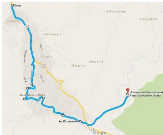
Figure 1. The trajectory was followed by the route of Santa Clara, Marabel, Juan XXIII, and the University.

M10 Quectel module located in the vehicle, information is sent in real-time of the location.